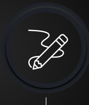
Pencil or marker