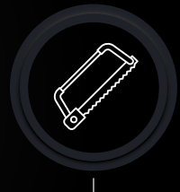
Saw (hand or electric)