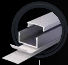
Spidertech LED Aluminum Channel (with pre-attached hook and loop tape)